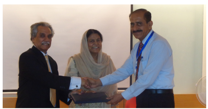
Second Strategic Development Workshop for HODs, 28 – 31 March, 2015 at COMSATS University, Islamabad campus. 20 Heads from several campuses of CIIT attended the workshop.