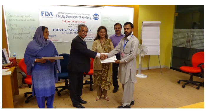
2-day workshop on Effective Writing Skills for faculty members, 20 – 21 October, 2014 at COMSATS University, Islamabad campus. 22 participants hailed from different departments of CIIT.