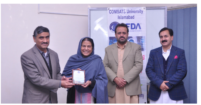
One – week Professional Training for SG – III & IV held at Abbotabad campus from November 18 – 22, 2019