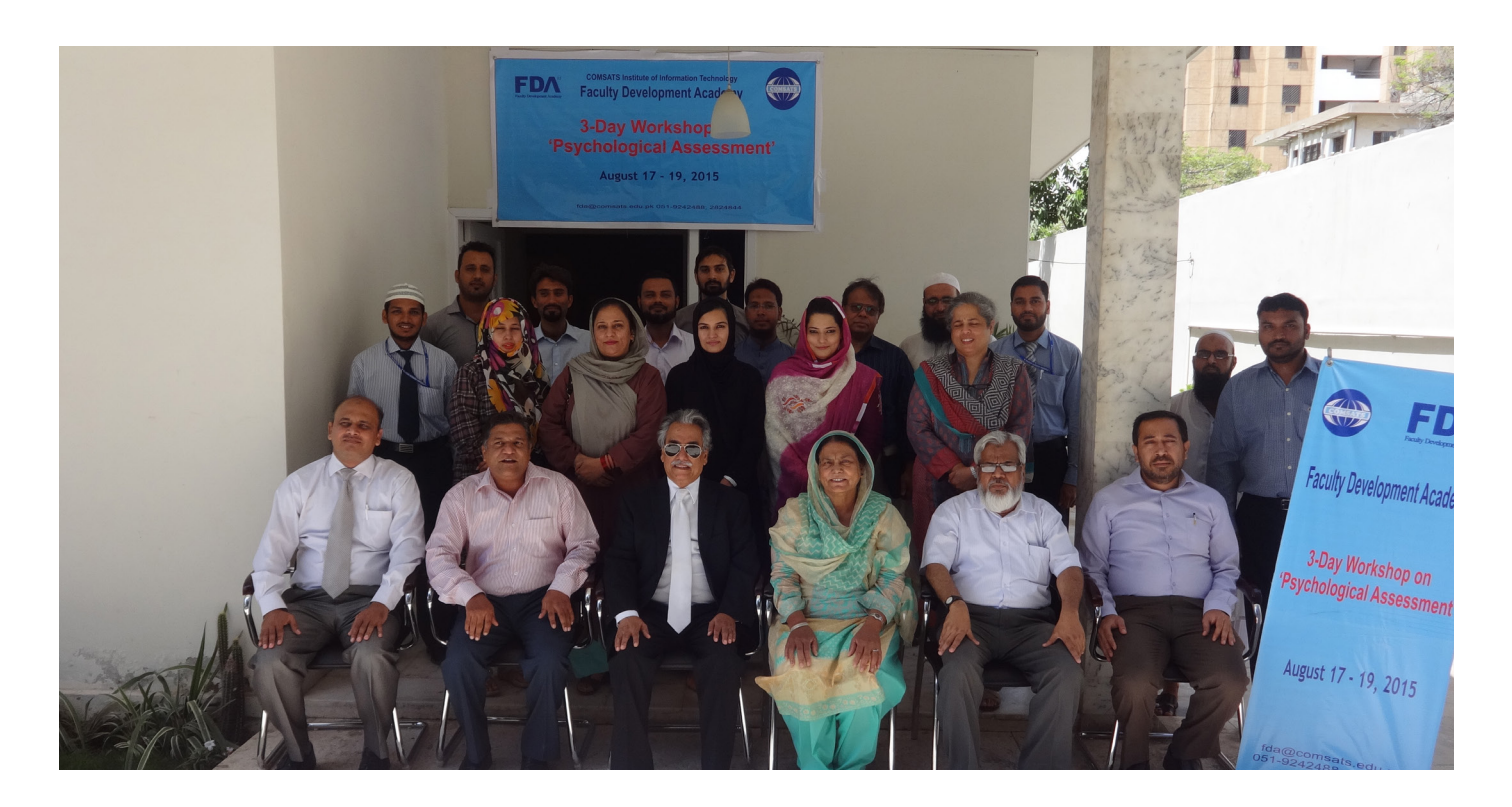
3-day workshop on Psychological Assessment, 17 – 19 August, 2015 held at Karachi.