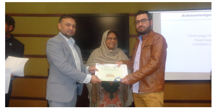
A seminar on 'Science Communication' held at Islamabad campus on February 27, 2019