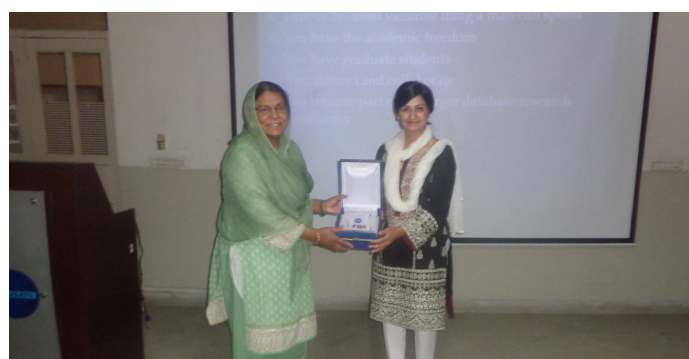
5-day workshop on Teaching as a Profession for CIIT Lahore campus from April 8 – 12, 2017