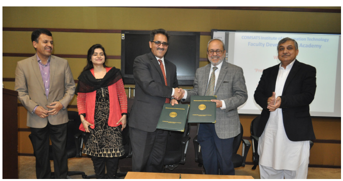
Professional Development Workshop for Faculty of University of Baluchistan, 13 – 23 December, 2016 at COMSATS University, Islamabad campus.