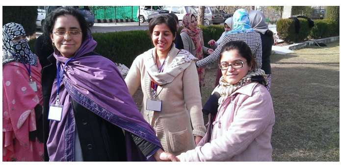
2nd Pre-Service Training Course, 2 – 27 January, 2012 held at COMSATS university, Islamabad campus. There were 98 participants who attended the workshop.