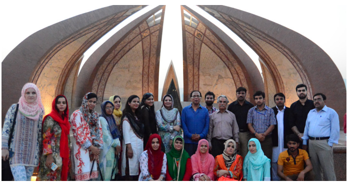
Professional Development Workshop for Faculty of The University of Faisalabad, 18 – 22 July, 2016 at COMSATS University, Islamabad campus. 32 participants attended the workshop.