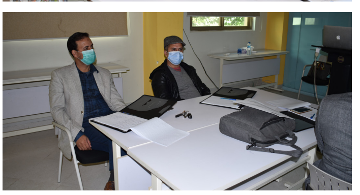
5-day workshop for Academic Leaders Why Leadership Workshop is Important, 14 – 18 December, 2020 at COMSATS University, Islamabad campus.