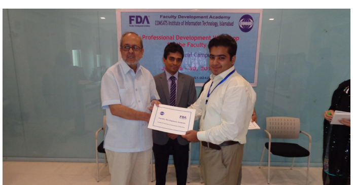
Professional Development Workshop for Faculty of Virtual Campus, 26 – 30 July, 2016 at COMSATS University, Islamabad campus.