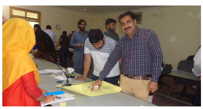
Professional Competency Enhancement Program for faculty of Vehari campus from July 29 – August 2, 2019