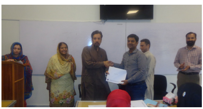
Professional Competency Enhancement program for Faculty members of Wah campus held from July 15 – 19, 2019