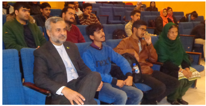
A seminar held at Islamabad campus for students on Moral Values on December 18, 2019