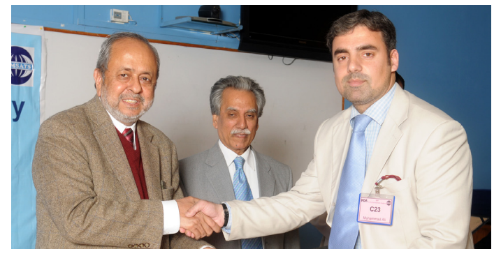
4th Pre-Service Training Course, December 31, 2012 to January 31, 2013 organized at COMSATS university, Islamabad campus. There were 70 participants in all.