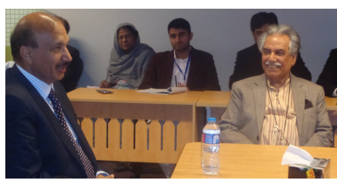
Professional Development Training for Young Faculty, February 27 till March 31, 2017 at COMSATS University, Islamabad campus.