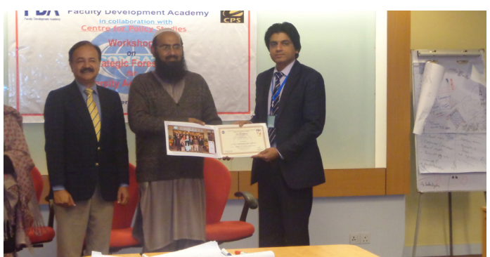
Workshop on 'Strategic Foresight for University Administrators' held at Islamabad from December 11 – 12, 2017