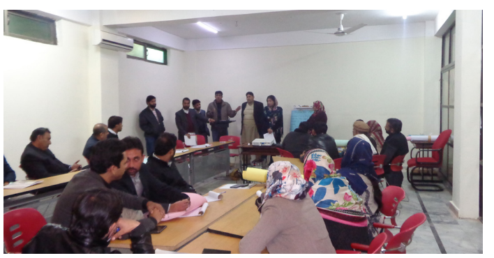
One – week Professional Training for SG – III & IV held at Islamabad campus from December 16 – 20, 2019