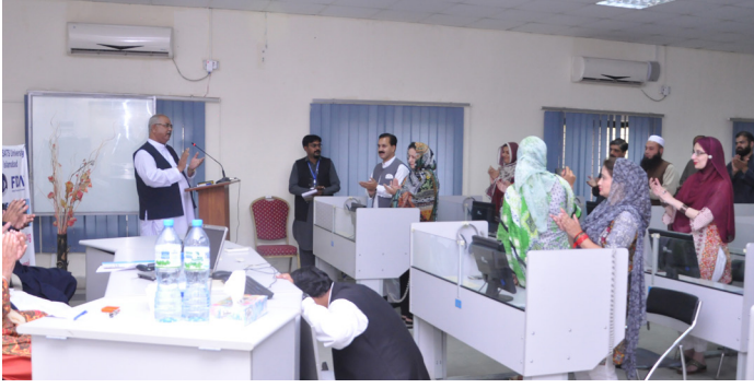
One – week Professional Training for Admin Personnel held at Abbotabad campus from September 23 – 27, 2019