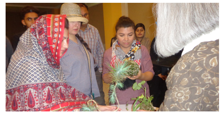
A one-day workshop on 'String the Spring' held at Islamabad campus on April 29, 2019