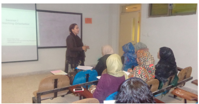
A workshop on 'Micro-Teaching: Become a Reflective Teacher' for the department of Biosciences held at Islamabad campus from March 1-5, 2019