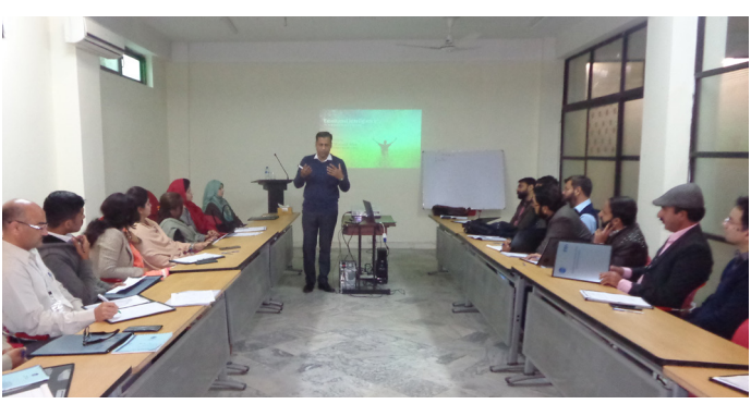
Career Enhancement Training Program for SG-III & IV, 09 – 17 March, 2020 at COMSATS University, Islamabad campus.