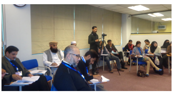
A workshop on 'Micro Teaching: Becoming A Reflective Teacher' in collaboration with Higher Education Commission from January 30 – February 03, 2017