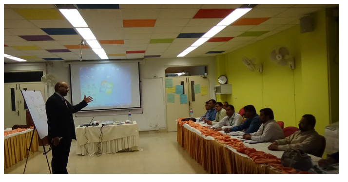
Professional Development Workshop for Non-Faculty Officers, 18 – 29 August, 2014 at COMSATS University, Islamabad campus. There were 29 non-faculty members who attended the workshop.