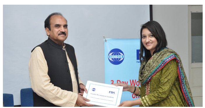
3-day workshop on Testing and Assessment, 29 – 31 October, 2014 at COMSATS University, Lahore campus. There were 70 participants in all.