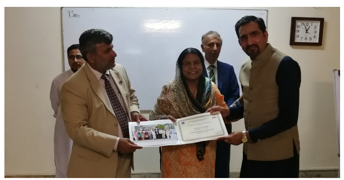
One – week Professional Training for OG-II held at Islamabad campus from April 8 – 12, 2019