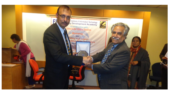
A workshop on 'Building High Impact Communication Skills for Leaders' in collaboration with Centre for Policy Studies (CPS) held at Islamabad from January 23 – 24, 2017