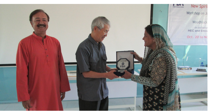
New Spirit – New Space, workshop on Japanese technique of Woodblock Print Making from October 20 till November 01, 2016 at COMSATS University, Islamabad campus.