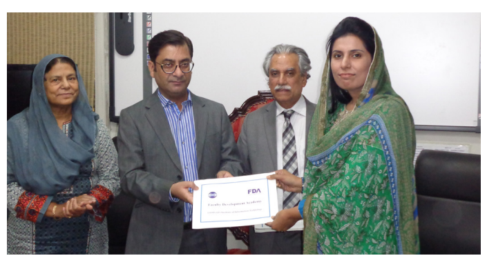
Capacity Building Workshop for Females, 21 – 24 April, 2016 at COMSATS University, Lahore campus. 26 females participated in this workshop.