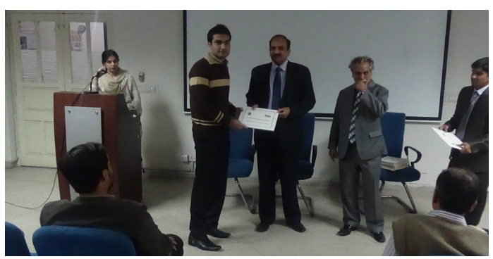
2-day Management Workshop on Office Procedures and Practices, 25 – 26 November, 2014 at COMSATS University, Lahore campus. 33 Admin Personnel attended the workshop.