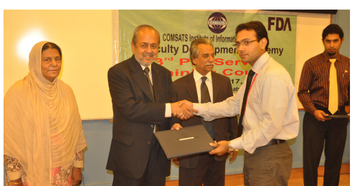
3rd Pre-Service Training Course, 9 – 17 August, 2012 held at COMSATS university, Islamabad campus. 56 participants attended the workshop.