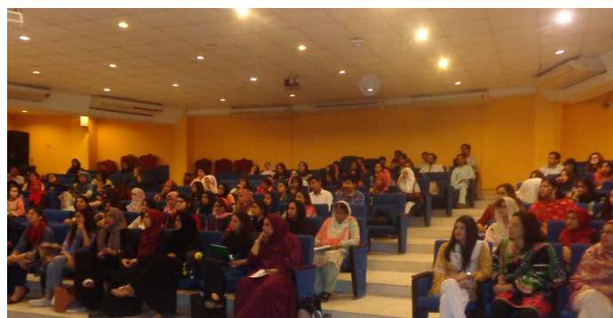
A seminar on 'Social Media Addiction' held at Islamabad campus on November 21, 2019