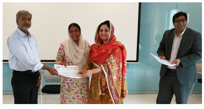
A one-day workshop on 'Teachers as Counselors' held at Islamabad campus on April 5, 2019